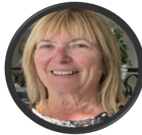
Jackie White SEND Governor